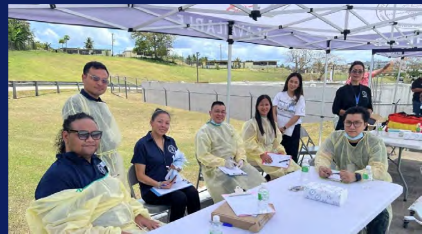
Triennial Airport Disaster Drill