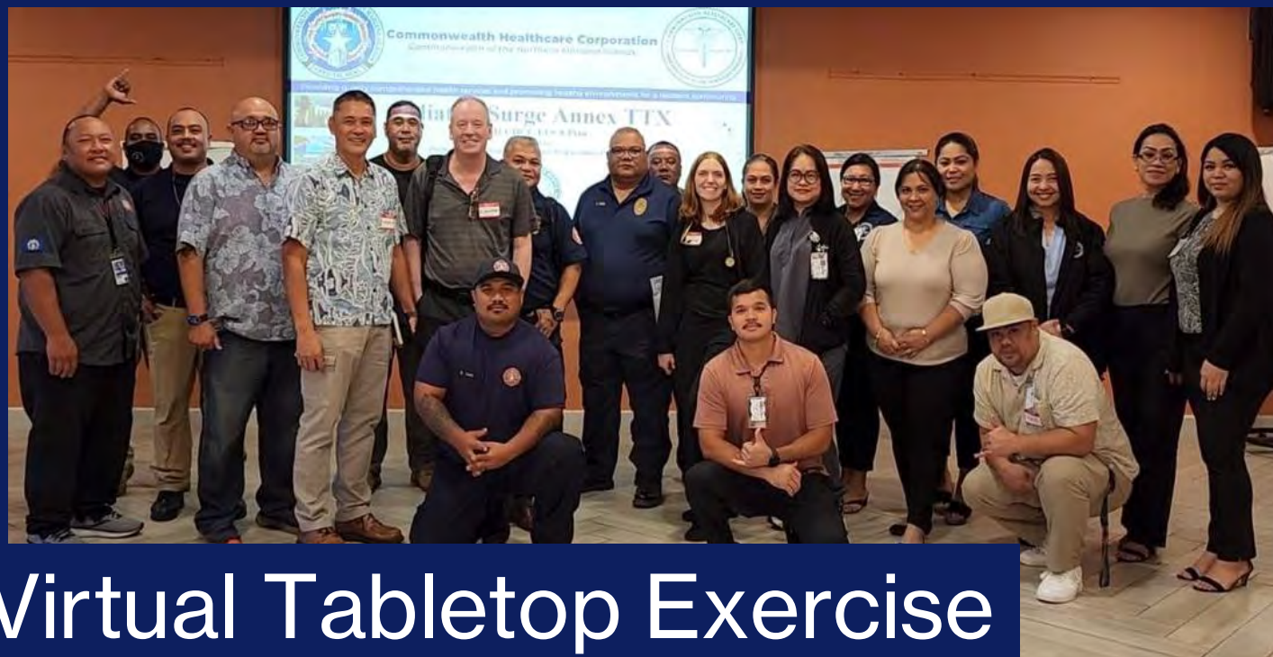
Pediatric Surge Virtual Tabletop Exercise